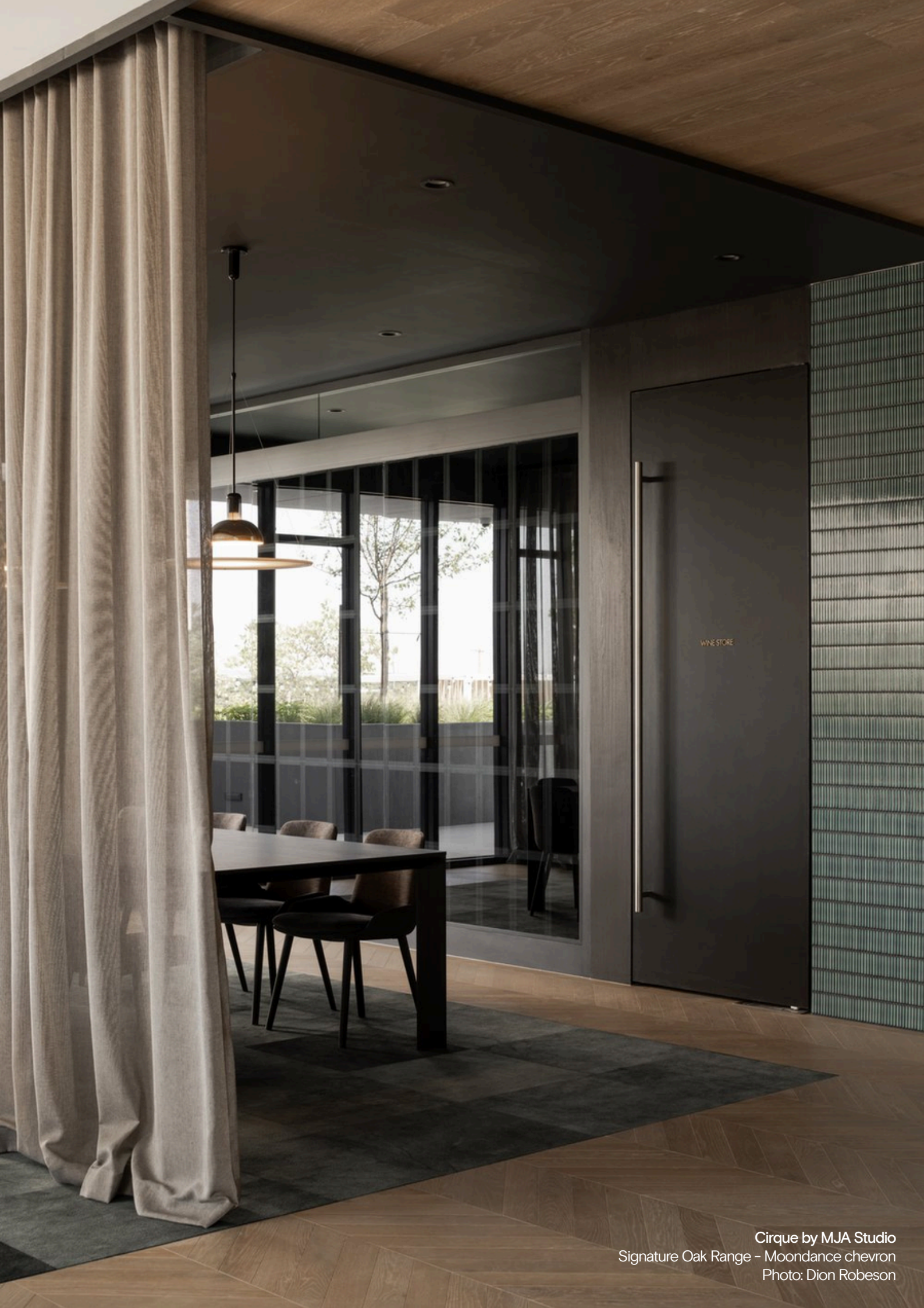
Cirque by MJA Studio Signature Oak Range - Moondance chevron