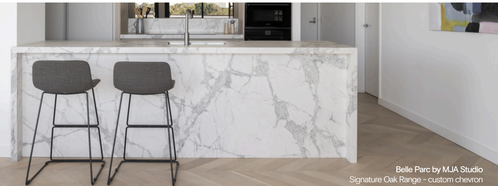
Belle Parc by MJA Studio Signature Oak Range - custom chevron

We'd love to discuss your specific project needs to please reach out to Tyler for further information on ordering your chevron flooring . tyler@woodpeckerflooring.com.au