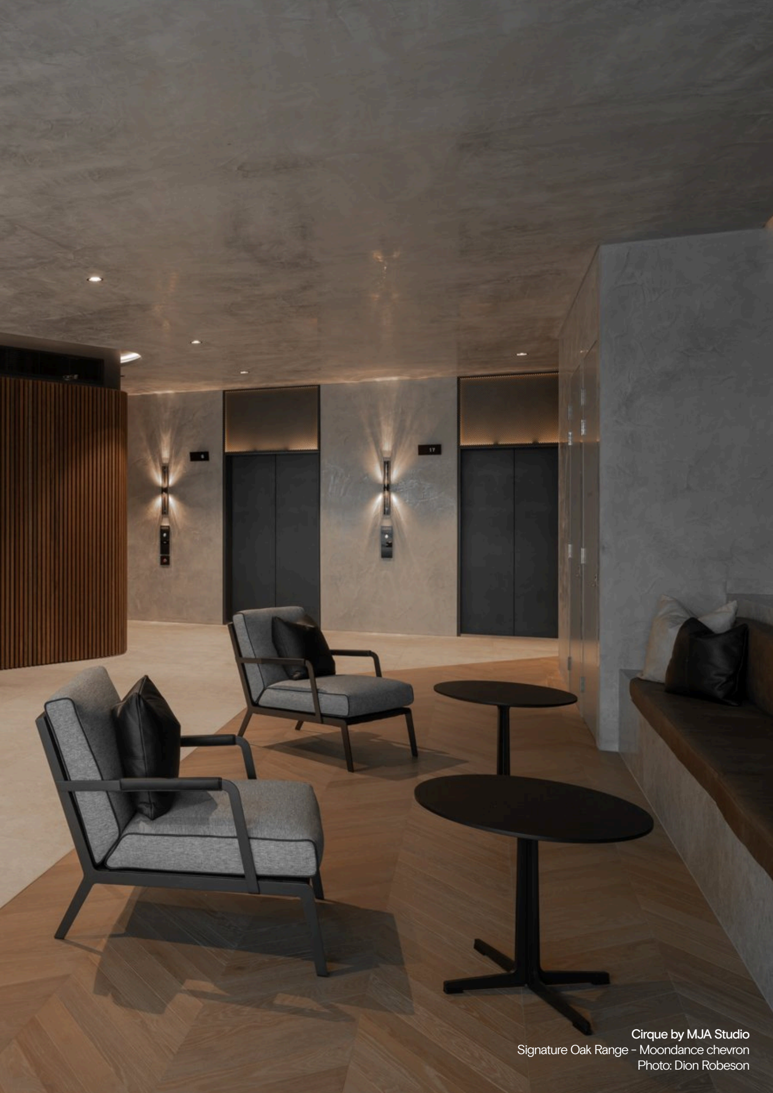
Cirque by MJA Studio Signature Oak Range - Moondance chevron